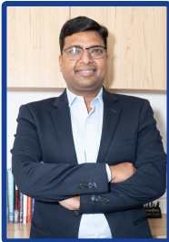
Co-Founder & CEO

As we embark on a new financial year, we wanted to take a moment to express our heartfelt gratitude to our customers, our partners, our employees and all other shareholders who has been a part of our journey and has supported and guided us.